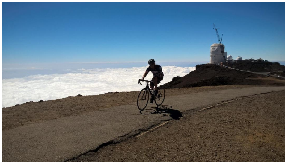
On Top of Haleakala looking down at clouds and ocean

What about Haleakala? Perhaps you want to climb it by bike to check it off your list of hardest climbs. John Sumerson's book "Climb by Bike" rates Haleakala as the 3 rd hardest climb in the US, and the 2 nd most in vertical feet (at 10,000, only less than Mauna Loa, HI). Perhaps you will want to drive up and take the spectacular hikes out of the visitor center at the top. Either way, you'll pass through 7 climate and vegetation zones, from humid subtropical lowlands to subalpine desert, and experience magnificent views. PLEASE NOTE: Our group ride will end at the Park Headquarters Visitor Center at 7,000 feet. However, you may complete the remaining 3,000 feet up and back (very doable) on your own.