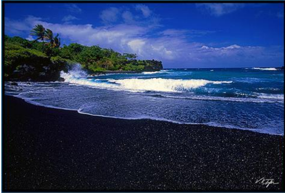
Black Sand Beach