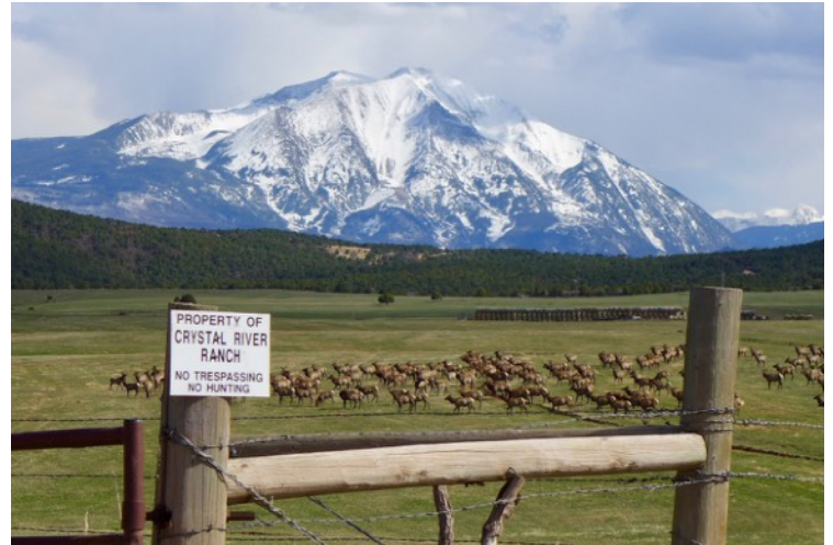
View of Mt. Sopris from Dry Park Road

Sunday July 11. Glenwood Springs Dry Park loop: 49 miles, 2,200 ft vertical with ~ 6 miles of gravel. We will roll down to Glenwood Springs on the Rio Grande bike path. The return trip takes us up towards the Sunlight ski area. A 6 mile cut across on the graveled Dry Park road through the Crystal River Ranch yields a new aspect of the Roaring Fork Valley, Mt Sopris and Capital peak. After a fast descent into Carbondale, the ride finishes with a cruise up the bike path to Basalt. The ride time is 3 – 3.5” hrs for easy get away timing.