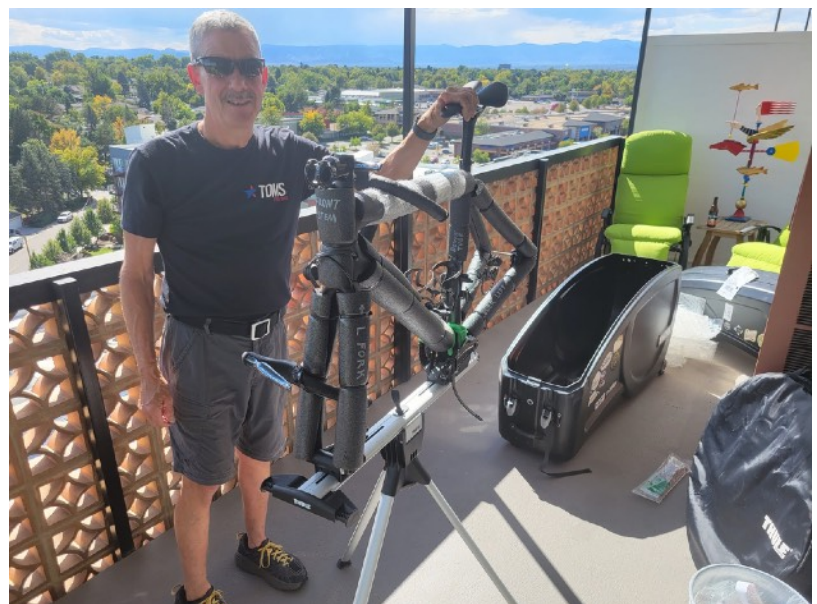
Almost ready to ride?