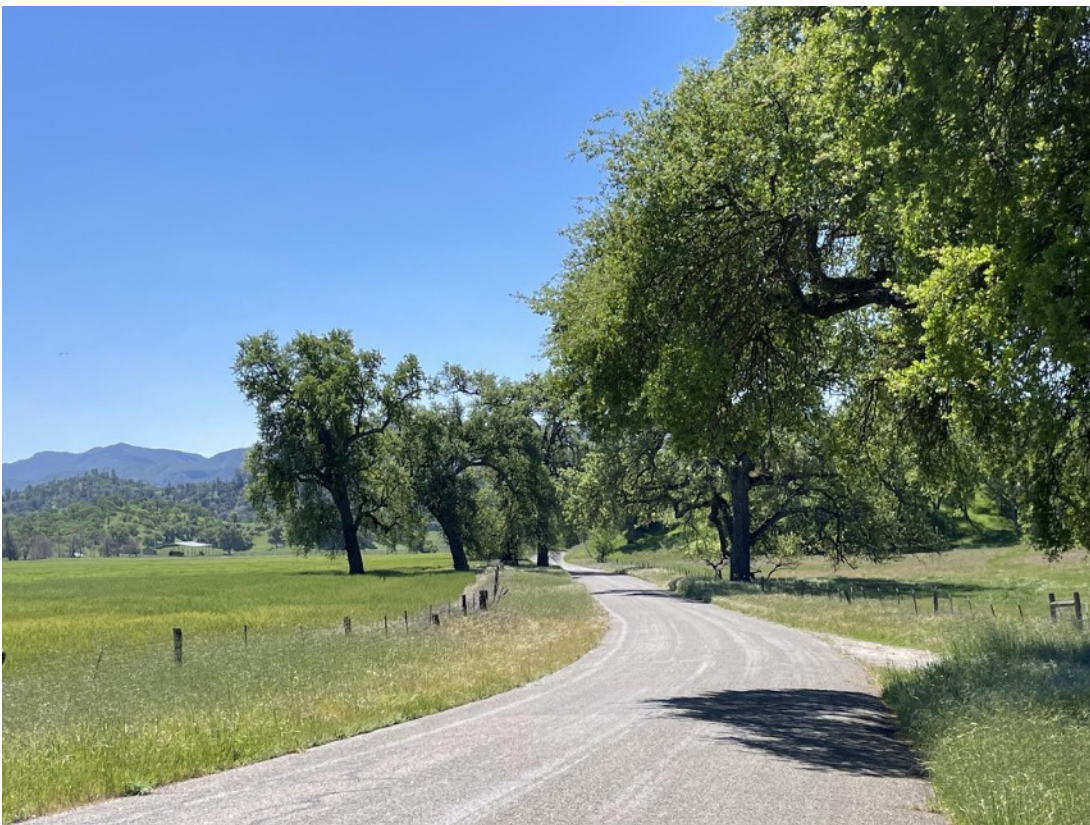
Rolling pasture lands today, and the perfect riding weather continues!