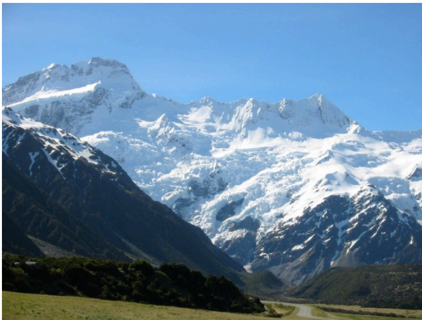
Road to Mt Cook, South Island, NZ

The second half of our adventure is characterized by the lush green rolling plains, wild windswept coastlines and unique wildlife experiences of New Zealand's southern most region. We cycle the scenic rural roads of the Fiordland National Park before visiting Invercargill, the world's most southern city. The wildlife experiences of the remote Catlins Coast, home to an ancient petrified forest, fur seals, rare Hector's dolphins and yellow-eyed penguins will leave you wide-eyed, before exploring Dunedin, a city known for its Scottish history, and the Otago Peninsula with its tiny villages and panoramic vistas.