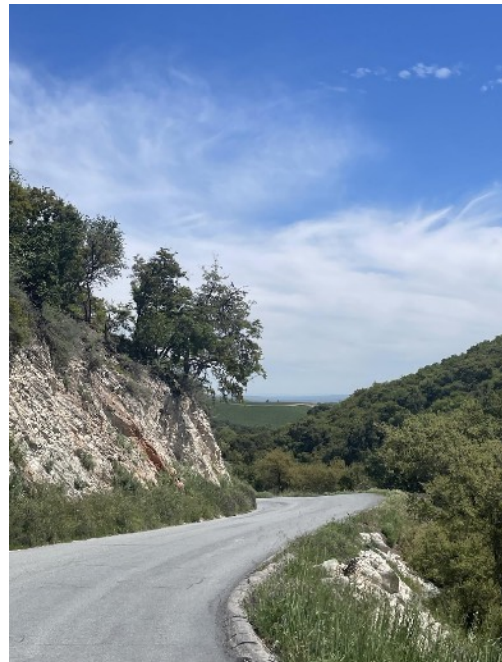
When we finally broke out of the hills, the screamer descent back into Paso.