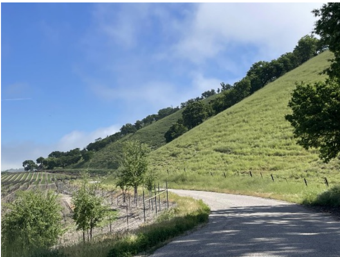
The beginnings of the Hog Canyon climb as the day's mist burns off. Still cool and lovely!