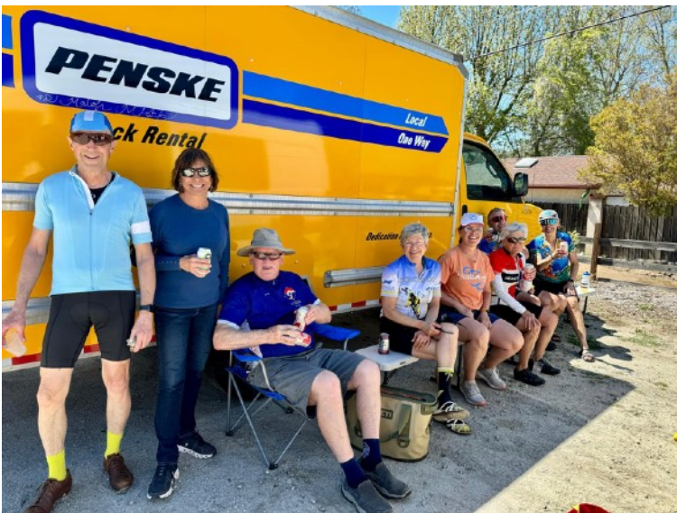
The wise seek shade at ride's end as we prepare to shuttle back up to Paso.