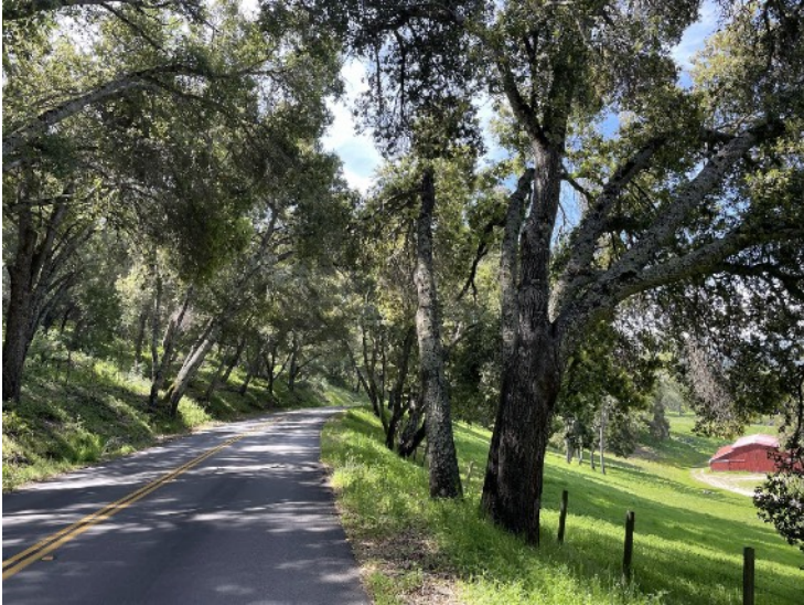
Shaded to perfection.

Day 4: Peachy-Pasolivo. Is it possible for the terrain and scenery to get any better? Yes! Most of us thought this one the favorite. After a long but manageable (and beautiful) climb to start the day we were treated to superb terrain and an olive oil tasting at Pasolivo. Lovely stuff!