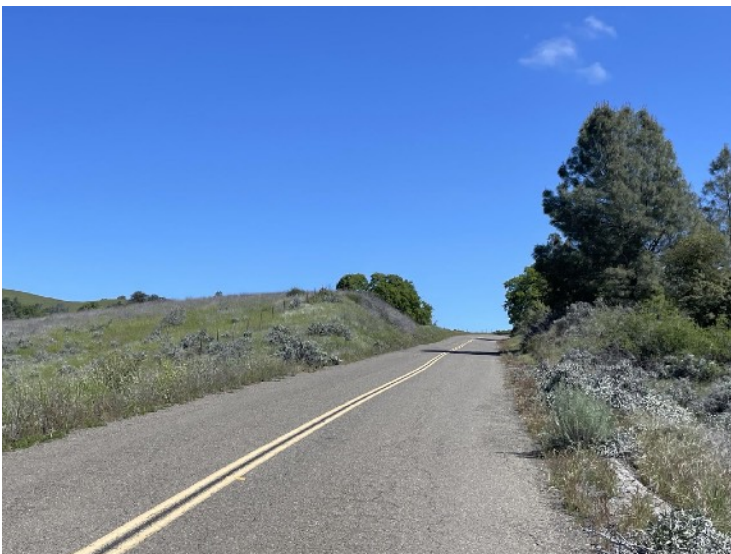
PLEASE, let this be the top. It was not.