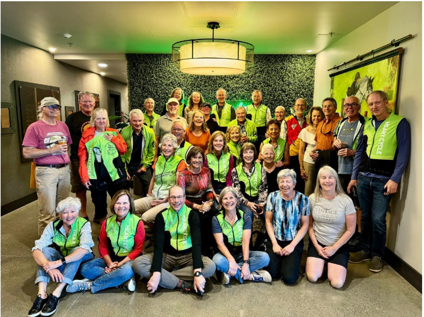
The full team. Happy folks, all!