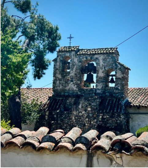
Mission San Miguel.