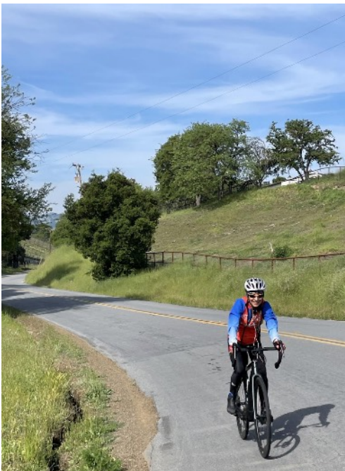
...with Polly catching on.