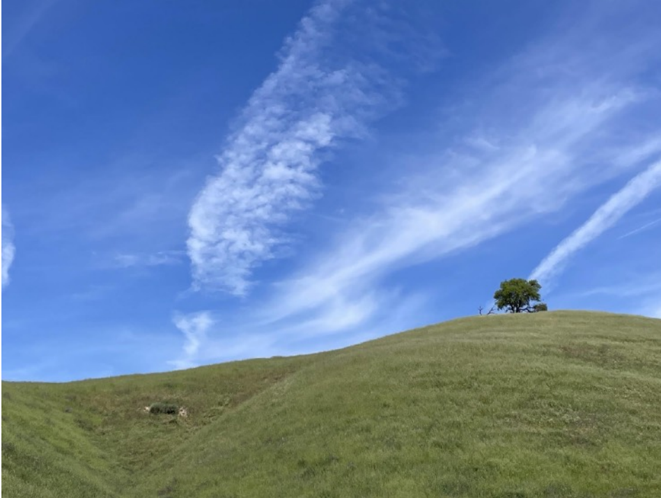
The allure of the lone tree.