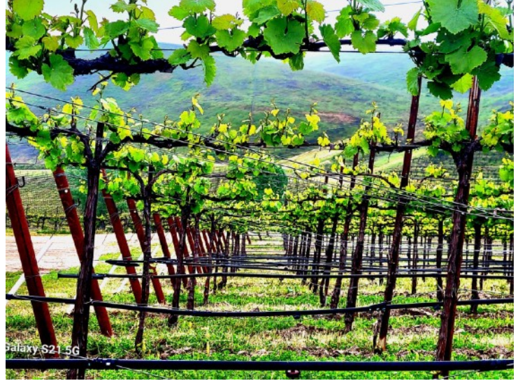
An artful vineyard shot.