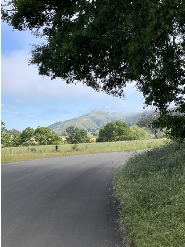
We had a gray, misty start, then it burned off, just like we planned!

Day 2: San Andreas Fault. This was the tough one: a long, steep climb, then a fast descent to lunch on the Fault at the Parkfield Cafe. Then back up and over the same ridge to return home. Easy does it!