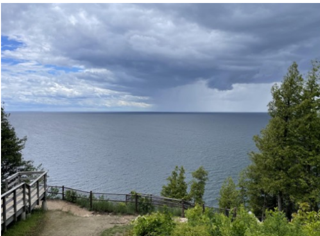
The view northwest from Ellison Bluff. Out there is the rain that caught us before lunch, now well out into Green Bay.