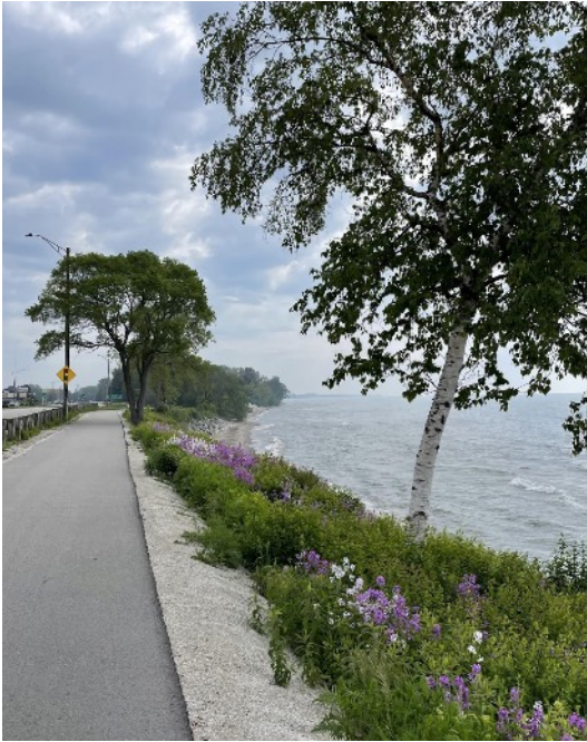
Lake shore riding at its finest!

Day 2: This was the nicest 63 mile ride in memory. Leaving Manitowoc, we rode up the east coast of the Door County peninsula and then crossed to Sturgeon Bay. The weather was cool and clear, the roads mostly smooth and quiet, and plenty of tailwinds to speed us on our way.