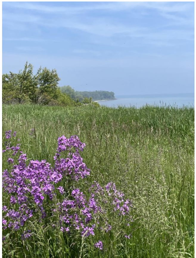
Lake vistas were many.