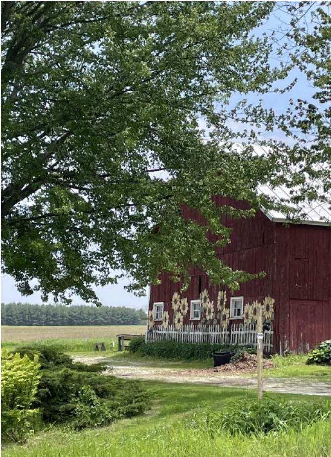
Points given for prettiest barn of the day.

Day 1: We rode southeast from DePere down to Manitowoc on the shore of Lake Michigan. At 40 miles and with reasonable climbing, it should have been an easy day, but the headwinds were taxing. Still, we got in ahead of some serious rain, a clear win!