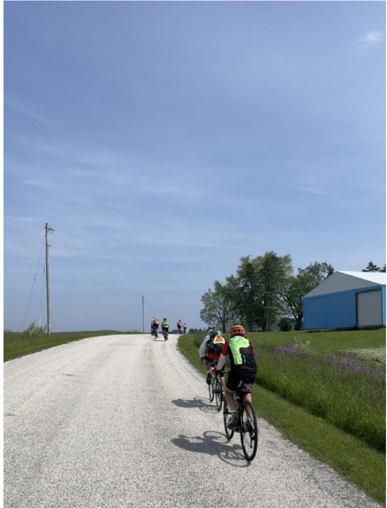
Riders in our group tackle one of the few hills of the day.