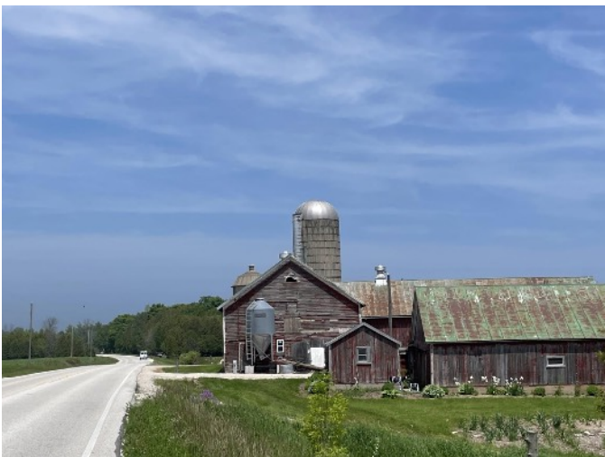
A distinctive roadside farm.