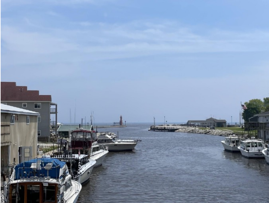
Crossing the Ahnapee River in the quaint coastal town of Algoma.