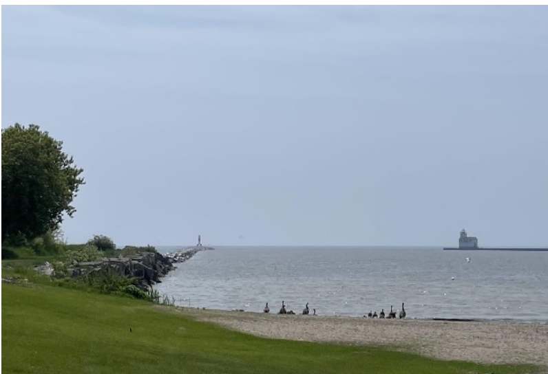
Jetties and lighthouses aplenty.