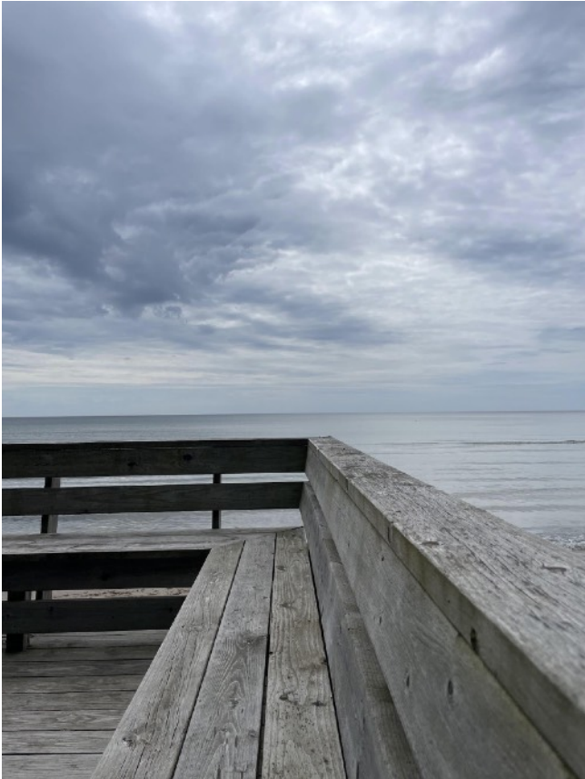
Our first water stop was at Sand Bay Park, overlooking Rowleys Bay.