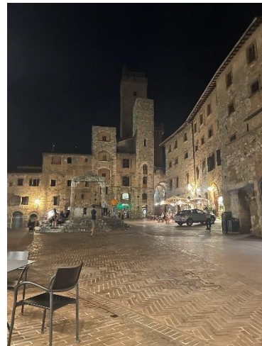
San Gimignano at night