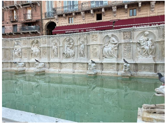
Fountain in Siena