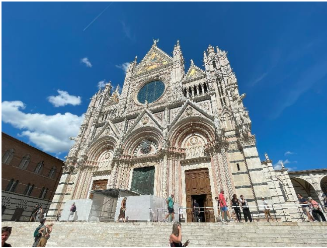
The Duomo in Siena