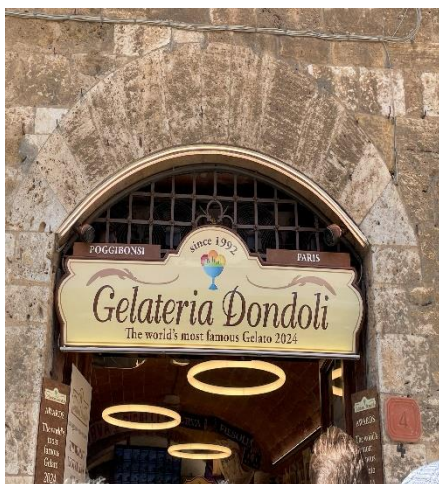
Best Gelato Italy 2024