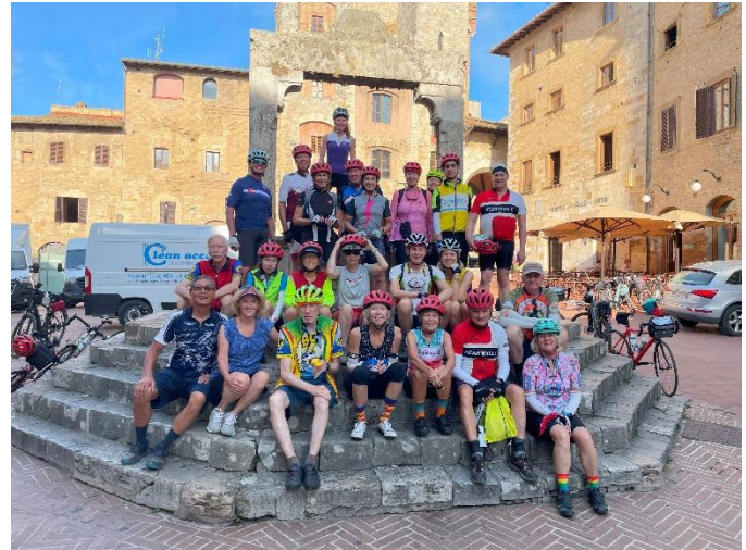
The Tuscany group at the fountain San Gimignano

Day 6 September 10, 2024. San Gimignano loop ride and hike to Castelvechio After our hilly countryside ride, we stop at the Fenzi Farm Restaurant for a wonderful sit-down lunch. Nancy and I are the first e-riders to this majestic restaurant as the roadies struggle up the hills. This is an area famous for Vernaccia white wine. After lunch we hiked through the woods to the abandoned village of Castelvechio. We meet David's arranged caretaker for a guided tour of the abandoned village (abandoned around the time Columbus sailed to America!) This village was very remote, hidden in the woods and private with a church and about five hundred residents.