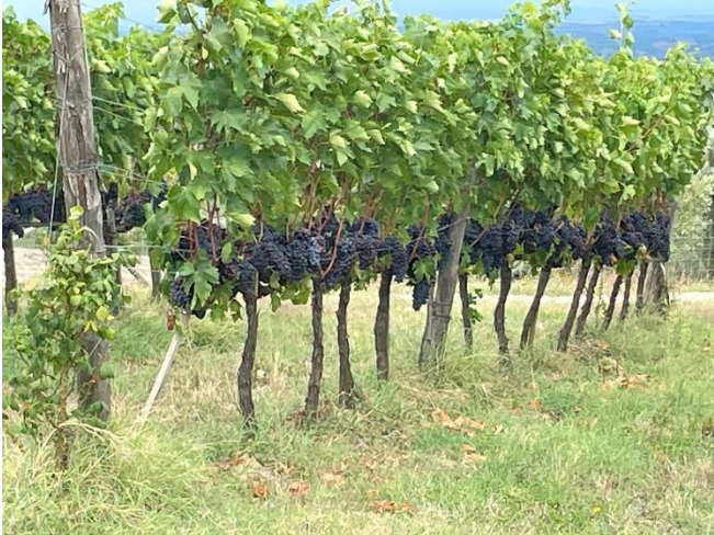
The Brunello grapes