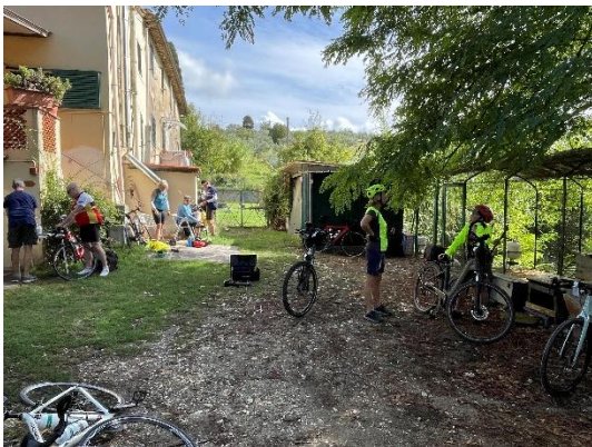
Fitting our bikes for our adventure