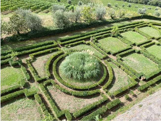
Courtyard at the castle