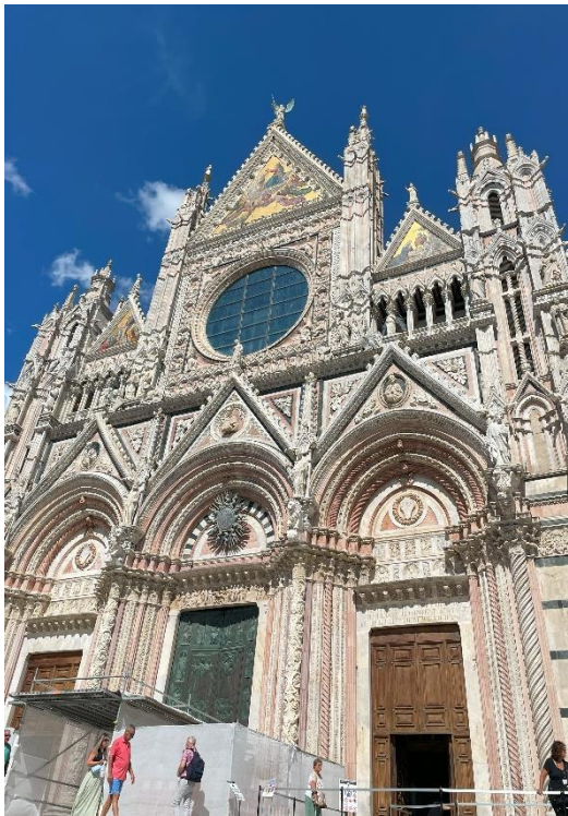
Front of the Duomo in Siena. Beautiful!!!