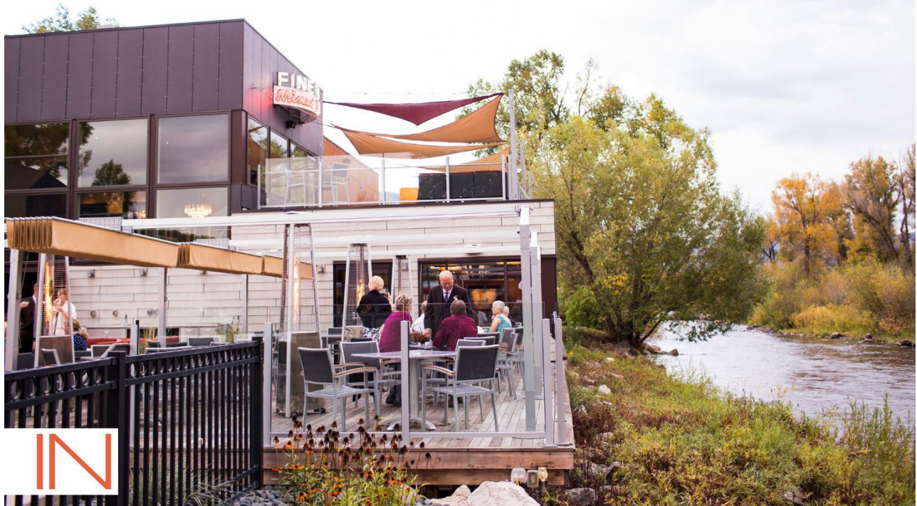
Aurum Food and Wine – Steamboat’s Best Riverfront Dining Experience